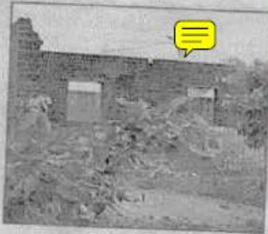
అసంపూర్ణంగా ఉన్న నిర్మాణం

ఆగస్టు 18 (వ్యూహబుడి): ఆగస్టు 18న సోమయ్యవగర్ ప్రభుత్వ ఉన్నత పాఠశాలలో అదనపు గది నిర్మాణం అర్థంతరంగా ఆగిపోయింది. ఏడాది శ్రీతం 6 స్వచ్ఛంద సంస్థ విద్యార్థుల సౌకర్యం కోసం అదనపు గది నిర్మాణం ప్రారంభించింది. అయితే అనంతరం నిధుల లేమిలో భవన నిర్మాణం పూర్తి కాలేదు. ప్రస్తుతం మొదటి గోడలతో వర్షంపడింది. దాతలు ఎవరైనా ముందుకు వచ్చి గది నిర్మాణం పూర్తియ్యాలంటే సహకరించాలని విద్యార్థుల తల్లిదండ్రులు, ఉపాధ్యాయులు కోరుతున్నారు.